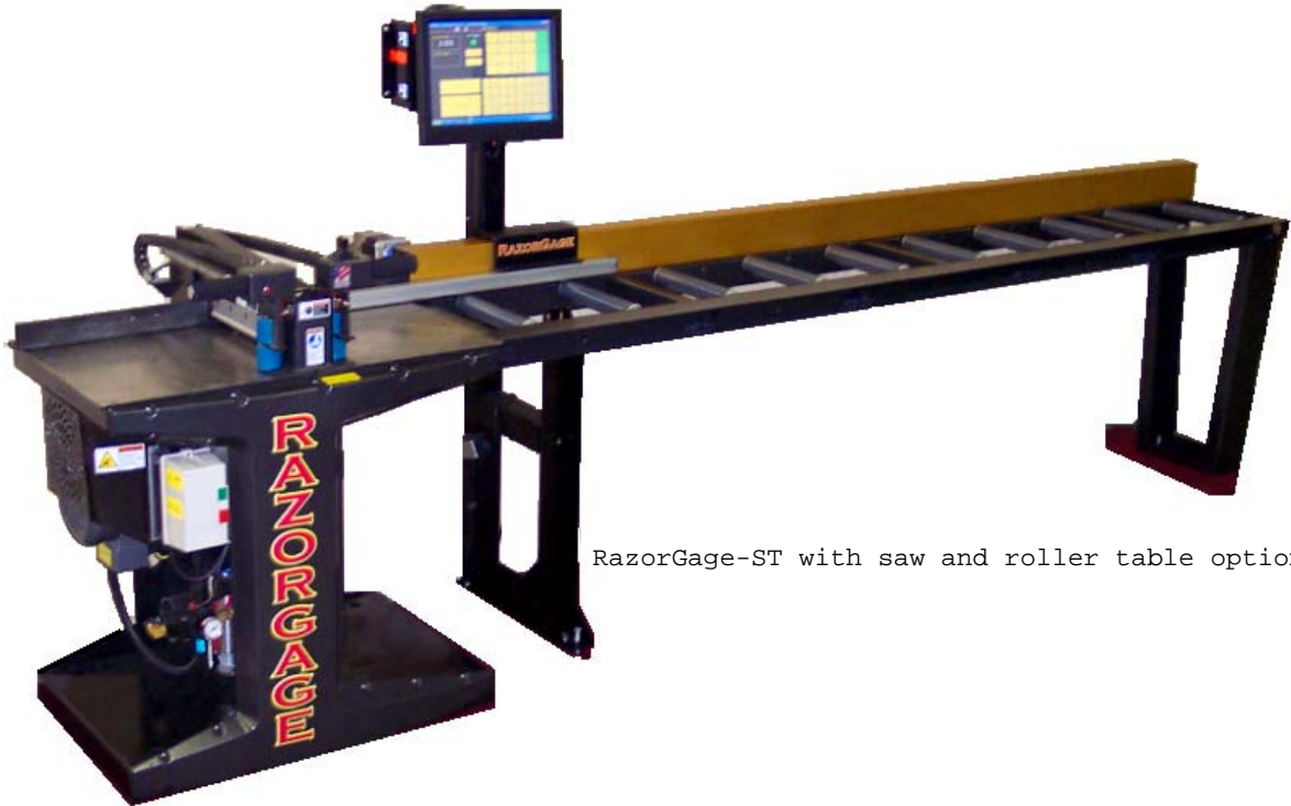
RazorGage-ST with saw and roller table options

software packages such as Glazier Center's Athena™.